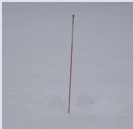
Snow stakes help observer's find snowboards, especially after a heavy snowfall.